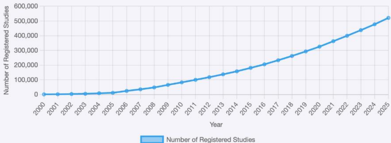
Number of Registered Studies Over Time (as of 2025-12-02)